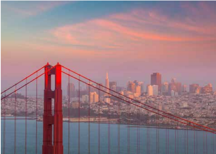
Golden Gate Bridge – San Francisco

Today after breakfast, check out from the hotel (check out time is 11 am). The hotel offers complimentary shuttle to the airport. Please check with the bell desk regarding shuttle timings. If you have any early flight & no shuttle is operational, please take a cab on own. (B)(Shuttle timings is from 5 AM to 9 PM)