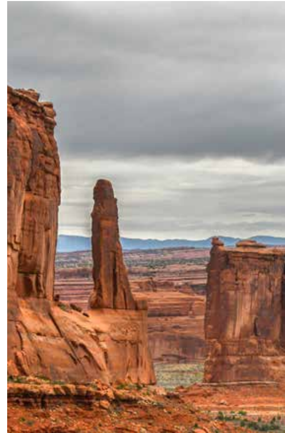
Grand Canyon National Park