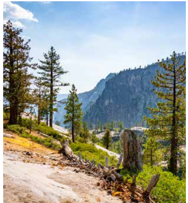
Yosemite National Park

Proceed to do city tour of Los Angeles. Enjoy a guided tour of Los Angeles by our experienced tour guide. Drive through the busy streets of Avenue of Stars, Dolby Theatre and rodeo drive. Get your picture of the famous Hollywood sign from one of the vantage points. Enjoy wonderful dinner