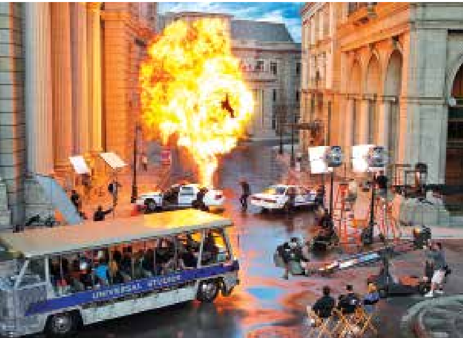
Universal Studios – Los Angeles

You will have a full day to enjoy in San